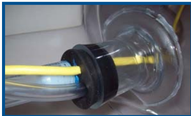
Extra Port for Anaerobic Gas Infuser located behind the airlock on all new Coy Anaerobic Chambers