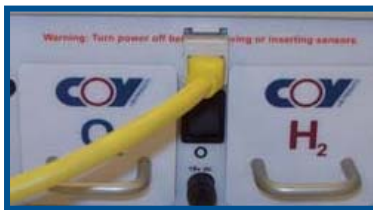
Communication Port now standard on all CAM-12's

Example of operation; When the chamber hydrogen level drops to 2.8% or lower. Valve on the Infuser opens to allow the anaerobic mix gas to enter into the chamber automatically. At the same time a one way valve opens allowing gas to slowly escape through positive pressure created by the injection of fresh gas mix. If the hydrogen levels do not reach 3.0% within 2.5 hours an alarm will trigger and the system will stop. The alarm has to be cleared prior to operating again and an on-screen guide is provided to diagnose the reason for the alarm.